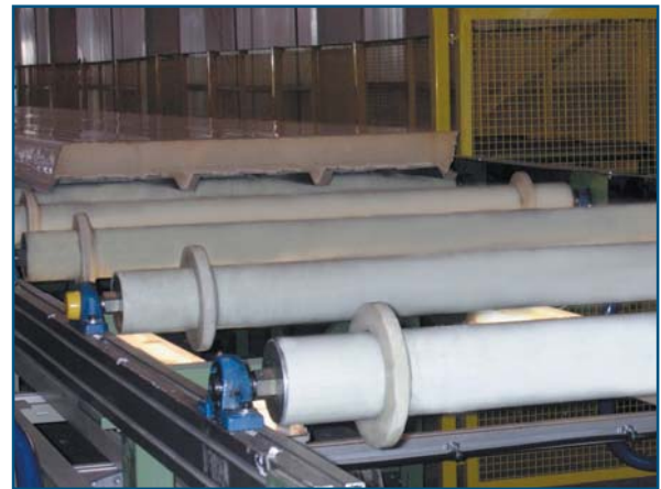
Non-marking surface protects products

Sleeves up to 60x65 mm are packaged in rolls of 30 m (100'). Sleeves from 65x70 mm are packaged as 3.20 m (10') tubes.